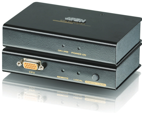
CE250AR (Remote unit)