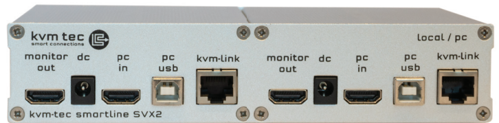
6502 Remote /CON unit