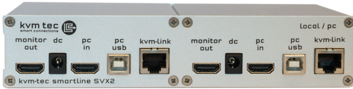
6502L Local /CPU unit

KVM can be so simple Let's connect! kvm-tec